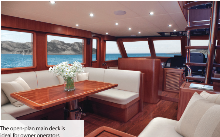
The open-plan main deck is ideal for owner operators