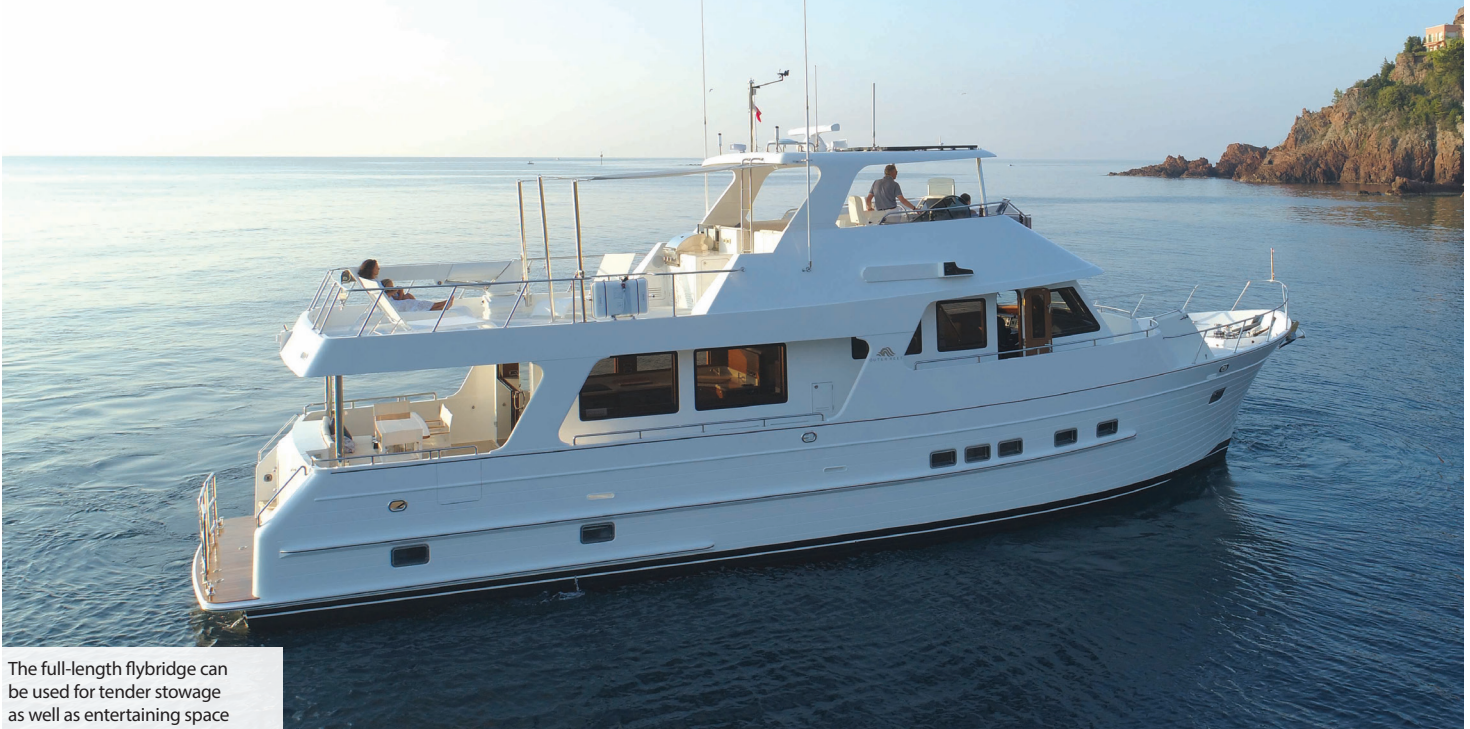
The full-length flybridge can be used for tender stowage as well as entertaining space

LOA 63ft 9in (19.5m) BEAM 17ft 2in (5.23m) ENGINES Twin CAT 475hp John Deere 500hp TOP SPEED 20 knots PRICE FROM €2.2m ex VAT CONTACT www.outerreefyachts.com