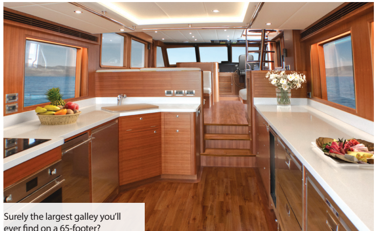
Surely the largest galley you'll ever find on a 65-footer?