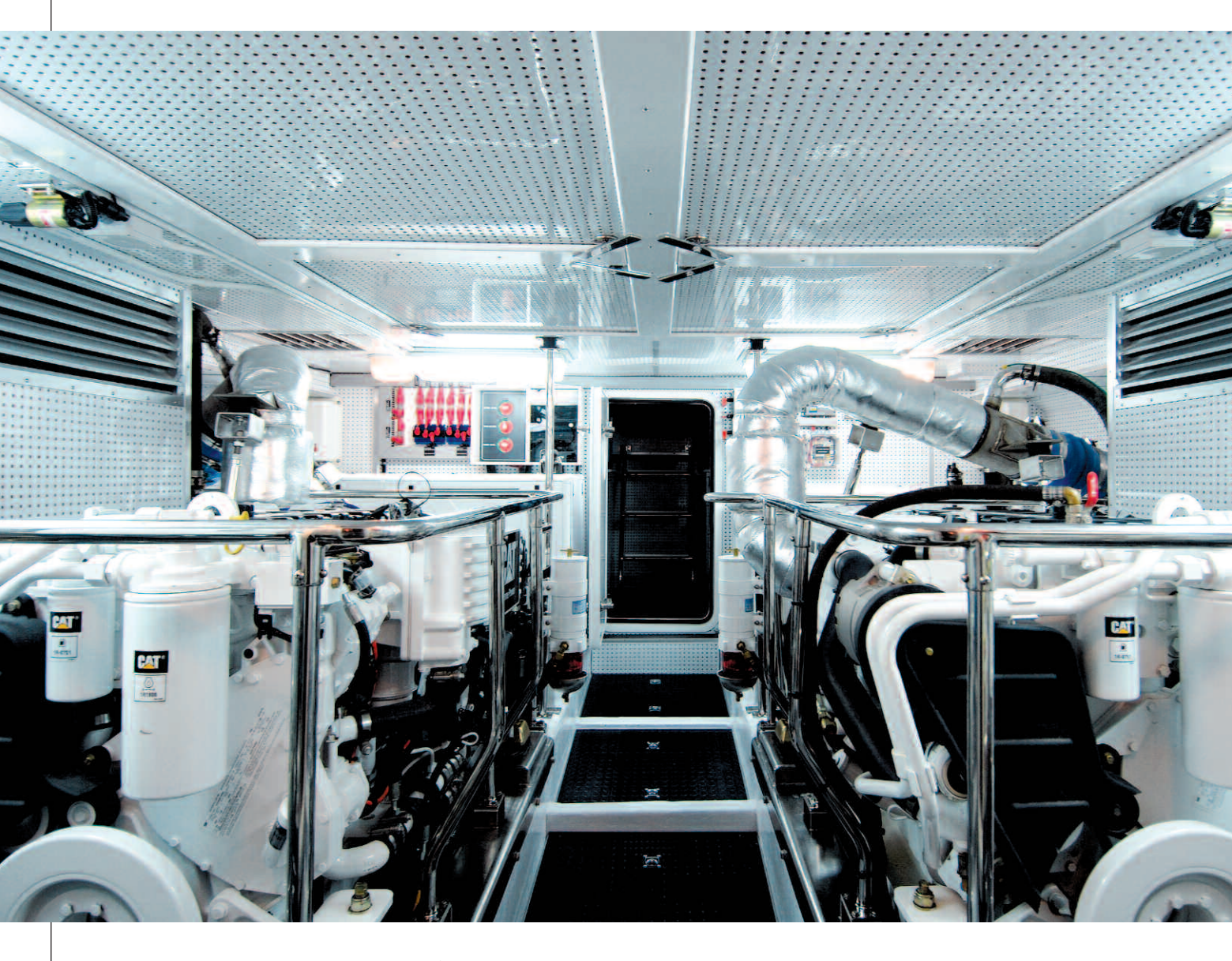
The OR 63's well-lit engine room is laid out for easy access during routine maintenance and is thoroughly insulated to reduce noise.

"There's flexibility with the layout on this level," said Fred Azar. "We have clients who want to make the port stateroom into an office, but it could be a walk-in closet or storage locker, too. There is storage everywhere, so that the owners can live aboard for extended periods."