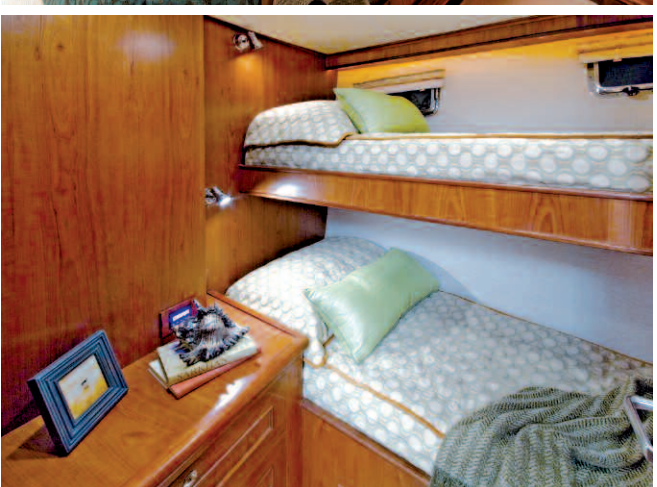
Above left: Meticulously crafted cabinetry, custom marble counters with backsplashes, and full-size appliances are found in the galley. Top right: Shoji-style screens add privacy to the master stateroom, where the island queen berth invites a restful night's sleep. Above right: The portside guest stateroom has over-and-under singles, perfect when grandchildren come for a visit.

where a single Stidd helm seat is specified to help make long days run shorter. Twin watertight doors allow easy access to the wide side decks on both sides. A full suite of Raymarine electronics was installed on this boat by Concord Marine in Ft. Lauderdale (they also installed the optional Bose home-theater system). They regularly work with Outer Reef customers to select and preplan the installation of wiring and electronics at the factory. There are good chases and conduits, should you ever want to update or add more electronics in the future, but it is more efficient to get it done ahead of time. Concord makes the final adjustments and ensures operational reliability during the final commissioning.