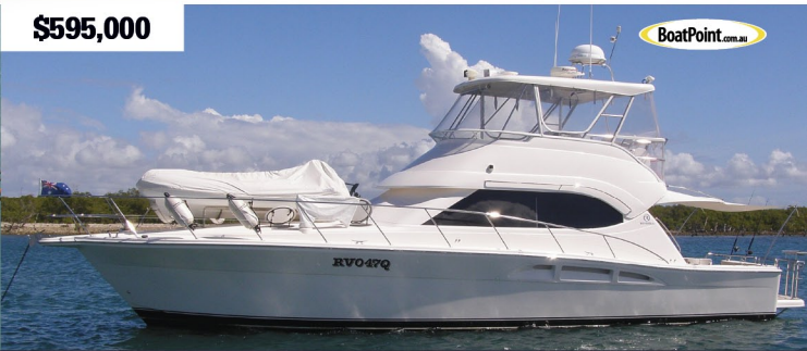
RIVIERA 47 FLYBRIDGE. 2004. Excellent condition. Onan gen, desalinator, bow and stern thrusters. Extra fuel tank, air-con, Raymarine electronics. QLD. Ph: (07) 3271 5888 $10 until sold. Visit DIYADS.com.au for more.