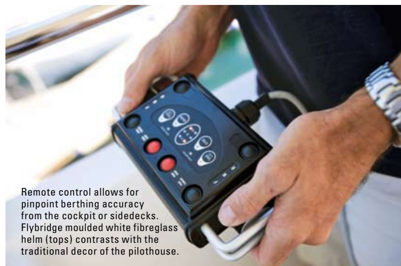
Remote control allows for pinpoint berthing accuracy from the cockpit or sidedecks. Flybridge moulded white fibreglass helm (tops) contrasts with the traditional decor of the pilothouse.

Outer Reef, being a smaller manufacturer, is proud to offer a semi-custom boat and the yard actively encourages owner participation in the design specs and involvement in all stages of the build process. Our test boat Aroona was unusual in that it was built as an in-survey