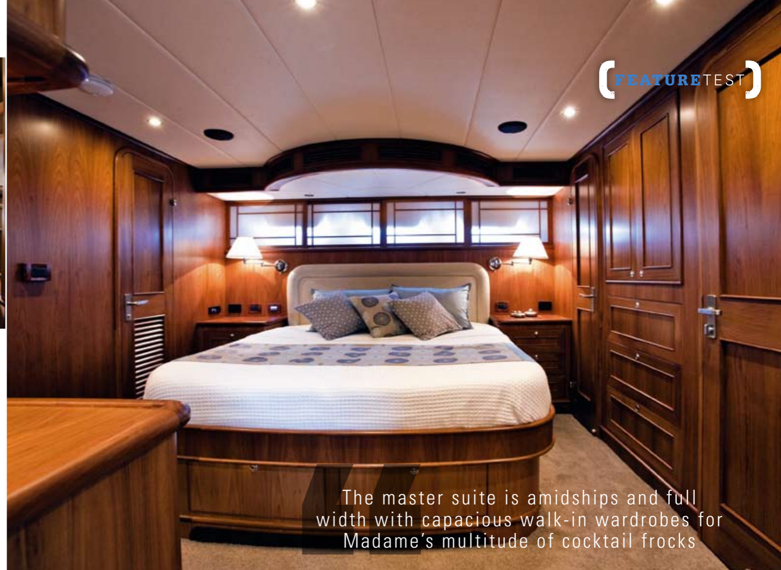
The master suite is amidships and full width with capacious walk-in wardrobes for Madame's multitude of cocktail frocks

The galley is placed up on a split level and fitted with a black granite bench and splash-back that to my eye looked a little heavy. An appliance specialist from LG had assisted with the specification and the appliances were all smart and shiny, including my particular must-have, an exterior-vented range hood. No doubt, one could order whatever are your favorite appliances. A double-door fridge-freezer had copious pantry space either side and there can be little or no excuse for the gourmet chef, other than he or she having too good a time elsewhere onboard to be bothered cooking. Indeed, aboard Aroona , a dedicated chef will have nothing better to do than prepare an endless stream of gourmet treats.