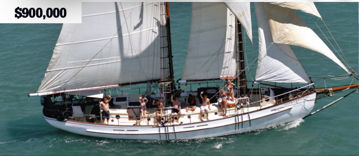
GLOUCESTER 62 SCHOONER. 1988. Wooden gaff-rigged schooner. Sleeps 15. 57hp Lister saildrive. Charter business included. Optional berth. QLD. Ph: (07) 4778 5580 $10 until sold. Visit DIYADS.com.au for more.