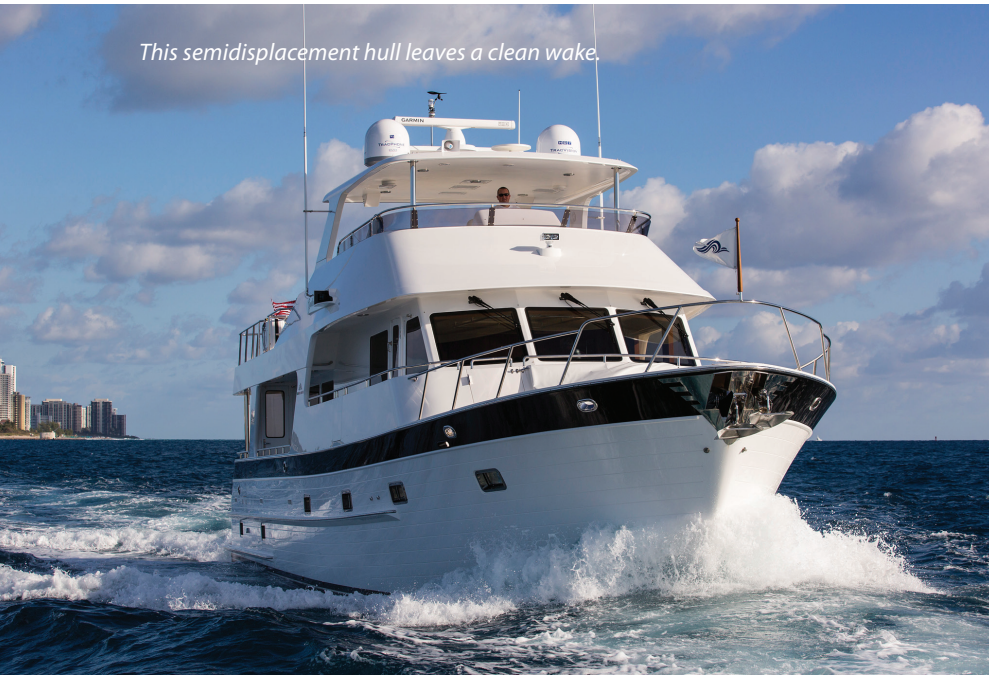
This semidisplacement hull leaves a clean wake.

ZF transmissions and propellers, Northern Lights generators, Cruise Air chilled-water air conditioning, Headhunter domestic water pumps, Grohe galley and head faucets, Tecma toilets, Kahlenberg air horns, Cantallupi LED lighting, Aquasignal running lights and General Electric galley appliances.