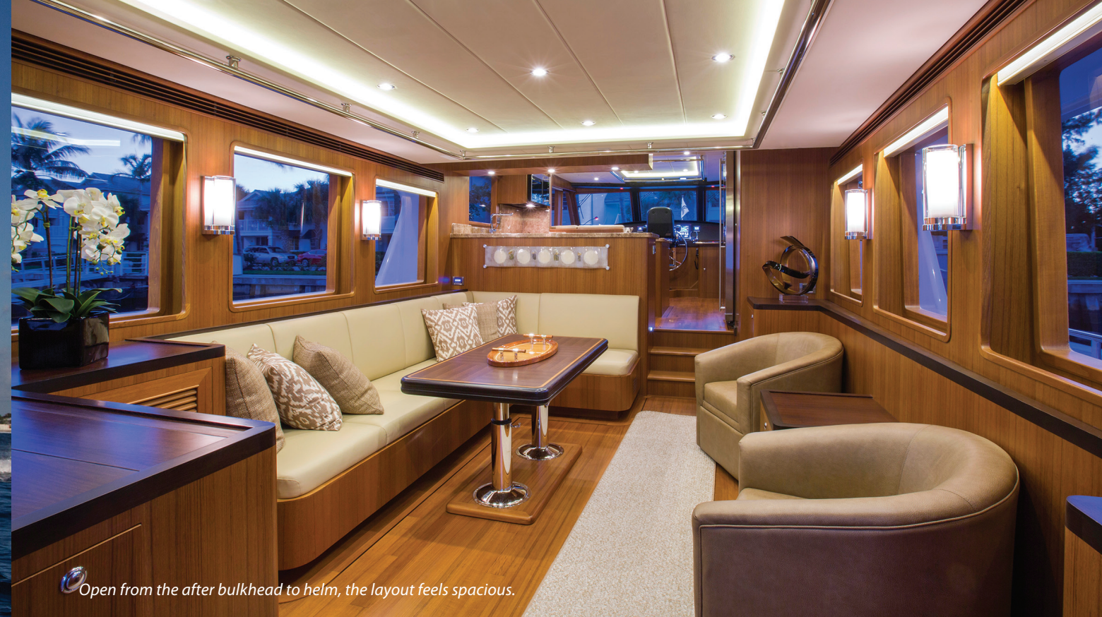
Open from the after bulkhead to helm, the layout feels spacious.

100,000 lb. through the water at 8.9 knots with a fuel burn of 1.0nm per gallon for a predicted range of 1,150nm. Back off another knot to 7.9 and she's getting 1.6nm per gallon, giving her a predicted range of 1,849nm. This is more than enough to prove her long-range motoryacht chops. (Both ranges assume a 10-percent fuel reserve and no generator time.)