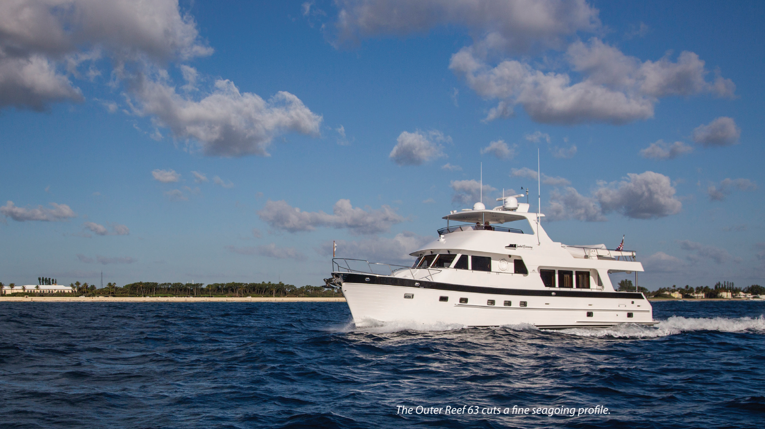
The Outer Reef 63 cuts a fine seagoing profile.

A lthough the company is just 12 years old, Outer Reef Yachts has established a reputation as a can-do company producing impeccably built fiberglass cruising yachts that make their owners uncommonly happy. With a salty trawler look, wide covered side and afterdecks, and moderate draft, these semi-displacement yachts offer an elegant way to cruise coastal waters and the islands in style and comfort. Think of Outer Reef yachts, at least the smaller ones, as ideal for genteel cruising.