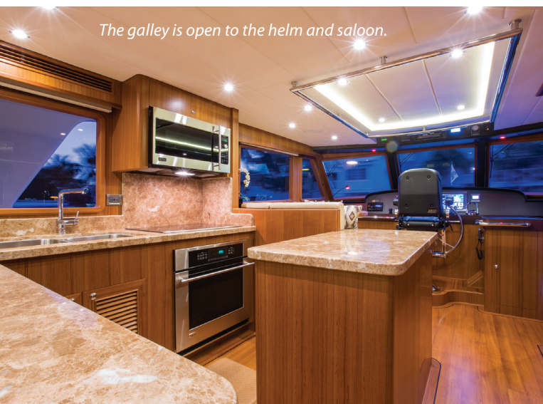
The galley is open to the helm and saloon.