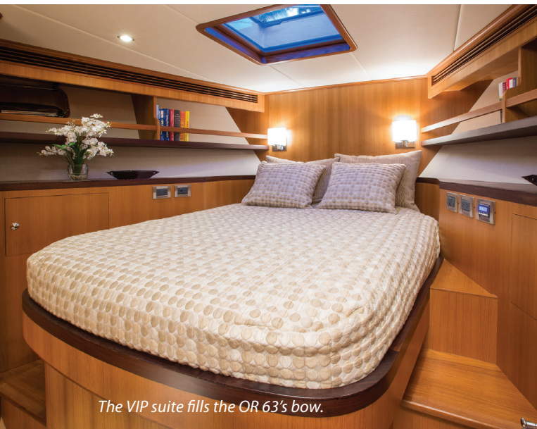
The VIP suite fills the OR 63's bow.

The Portuguese bridge, 42 inches high, provides a protected on-deck location and wave break ahead of the pilothouse. Access to the foredeck is by way of a hinged door. Guided Discovery's foredeck has bulwarks topped by stainless steel rails (37 inches high), an anchor platform with two anchor rollers and stainless steel plow anchors of 110 and 75 lbs., and a big hydraulic Maxwell HWC3500C anchor windlass with two gypsies. Saltwater and freshwater wash-down pumps feed outlets at the windlass. Hawses, cleats, chocks and deck drains