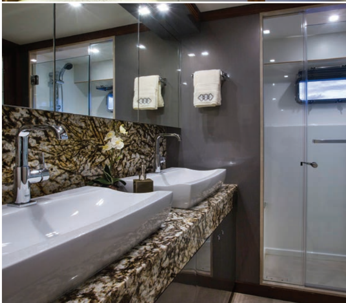
Clockwise from bottom left: The wheelhouse provides easy maneuverability and panoramic views with its sleek, modern design complimented by classic woodgrain; the master ensuite head is a luxurious retreat with counter-mounted double sinks on the impressive granite stone slab counters; the full-beam master features an open, chic design with double port lights on either side; the midship saloon is just aft of the open galley for a continuous, expansive space throughout the main deck.

is characteristic of the tasteful elements. The round bowl is centered on a light-and-dark granite countertop, and a shiny faucet reflects the amber coloring as it arches over to deliver water. Pethel also visited various stone suppliers in Taiwan and assisted in the selection of specific stone slabs.