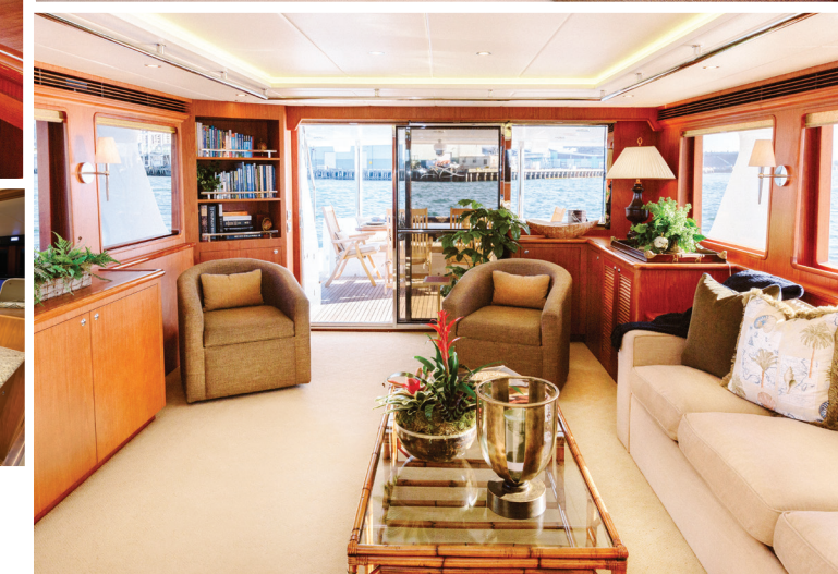
The attention to detail in the engine room (lower left) is reflected throughout the rest of the Outer Reef 880, especially in the salon and galley, where personalization is encouraged.