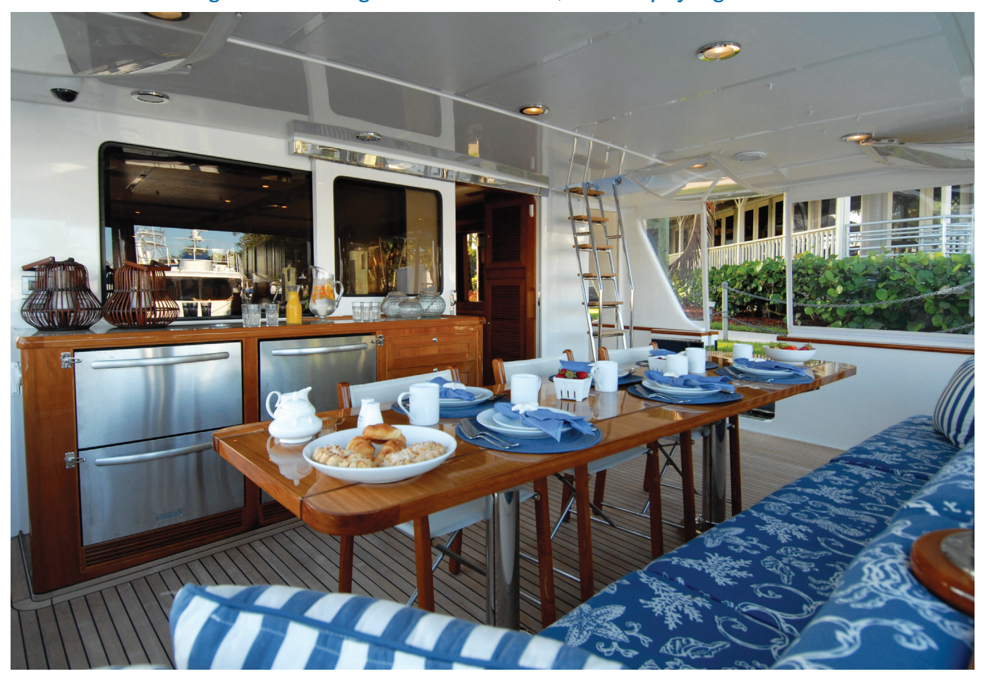
Sunbrella fabric is a smart choice for covering furniture in the aft deck area, which often takes a beating from the sun and wet bathing suits alike.

Among a host of seakindly features onboard the 860, the engine room deserves a special note for its 6-foot-5-inch-plus headroom, good access to at least three sides of the Caterpillar diesels and Northern Lights gensets (the owners upgraded from 25 kW to 30 kW) and the chilled-water air-conditioning system, which is standard on all Outer Reef Yachts 65 feet and up. The company prides itself on a standard noise- and vibration-reduction package, which includes gasketing every interior door to minimize the possibility of rattles. ABT Trac 250 stabilizers with 7.5-square-foot fins are standard, as are sea chests—an Outer Reef hallmark.