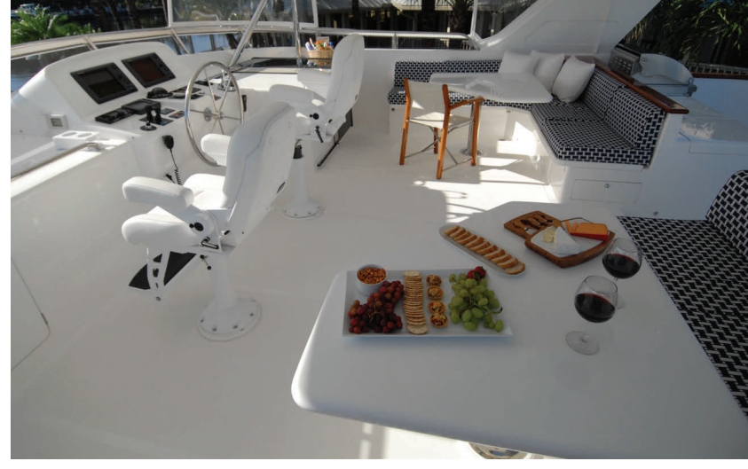
A nonskid surface and stainless steel safety rails are smart design decisions for the flying