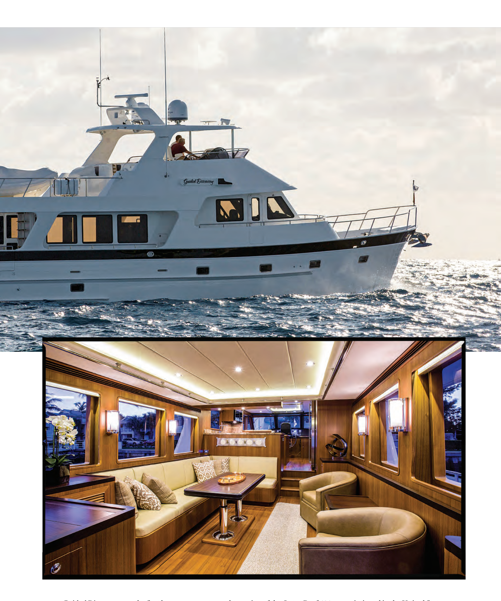
\textit{Guided Discovery} \ \text{was the first long-range motoryacht version of the Outer Reef 630 commissioned in the United States.}